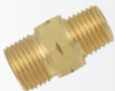
957 - AO15-ARCD